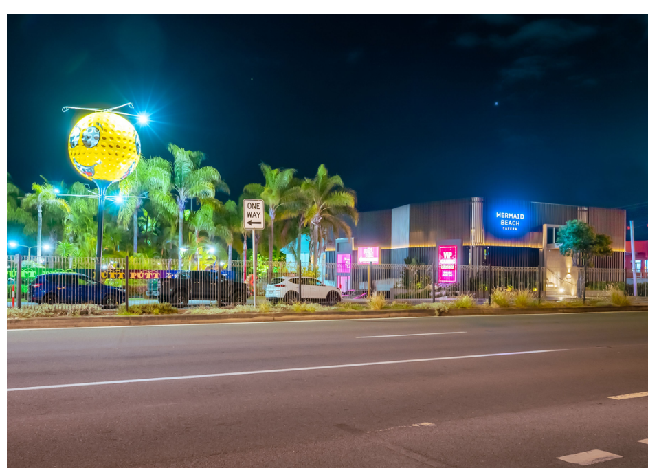
Today, Putt Putt Mermaid Beach sits alongside JDA Hotels' owned Mermaid Beach Tavern on the Gold Coast Highway.