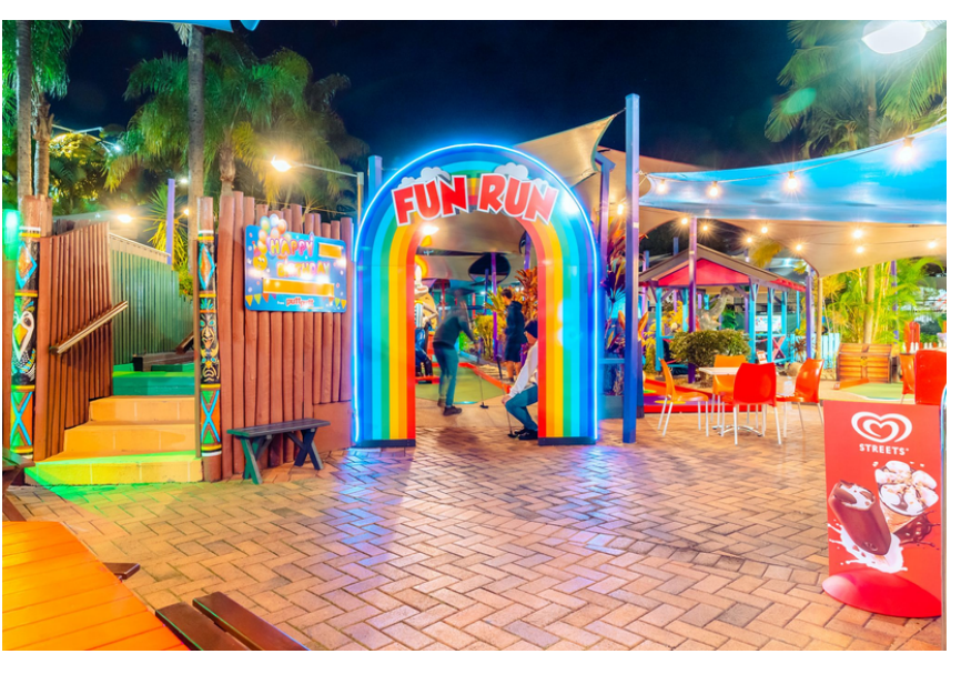
JDA Hotels aims to enhance the magic of Putt Putt Mermaid Beach while staying true to its rich heritage and nostalgic charm.